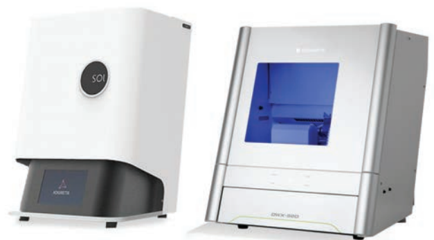
SOL LCD 3D Printer